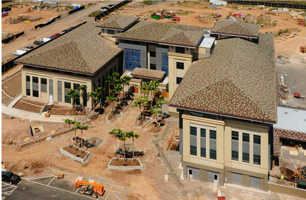
The Kapolei Court Complex

Senate President Colleen Hanabusa, who was instrumental in securing state funding for the complex as chair of the Committee on Judiciary and Government Operations, said, "The vision of a true second city must include establishments such as the Kapolei Court Complex. The